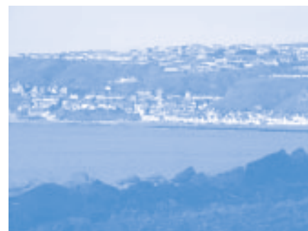
Gardenstown from bottom of Mohr Head.

Some concern has been expressed about antisocial tenants , both private & council. [H&SW, GP, CSP]