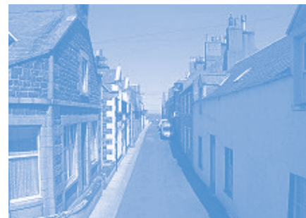
Main Street, Gardenstown.

A common issue raised in the consultation is that the laird should take responsibility for his land & buildings . The amount of litter left in verges in and outside the village also has attracted criticism. [P&ES]