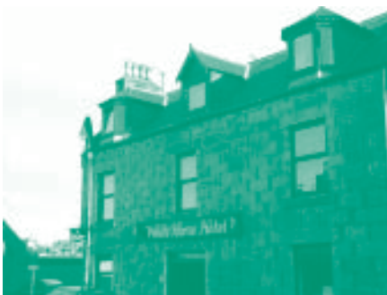
The White Horse Hotel.