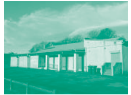
The Ritchie Hall.

Many other suggestions received support and these are listed on pages 6 - 9. A summarised Action Plan can be found on pages 10 and 11.