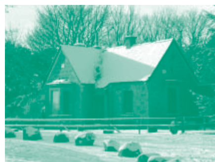
The Lodge at the Lake.