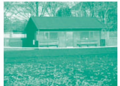
Tennis Courts and Pavilion.