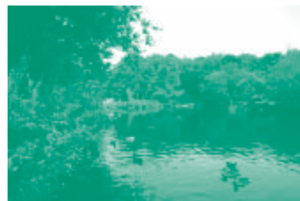
Strichen Community Park - The Lake.