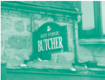
The Butcher's Shop.