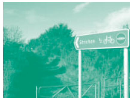
The Formartine and Buchan Way.